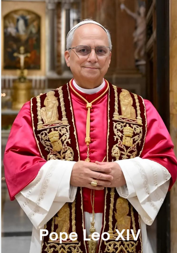
Pope Leo XIV