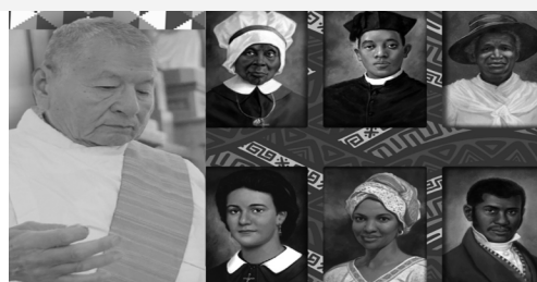
Black and Indian Missions Collection Sunday, February 22, 2026