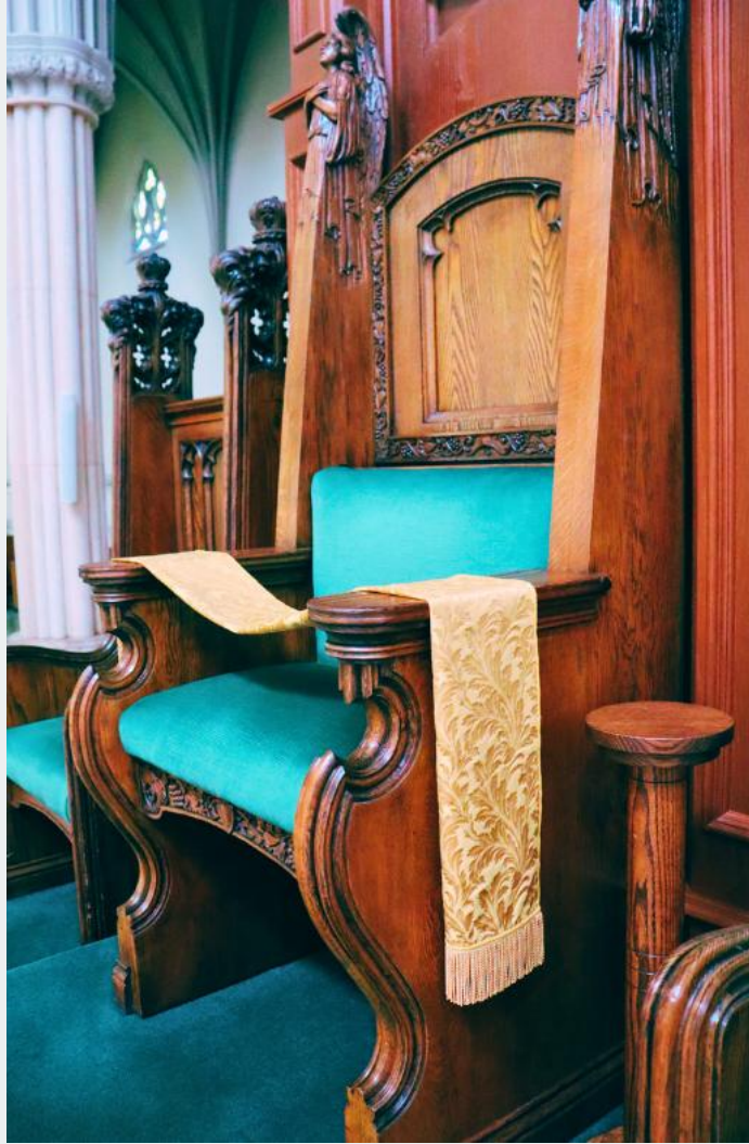
The Bishop's Chair at the Cathedral of St. Peter awaits the announcement of the 10th Bishop of Belleville.