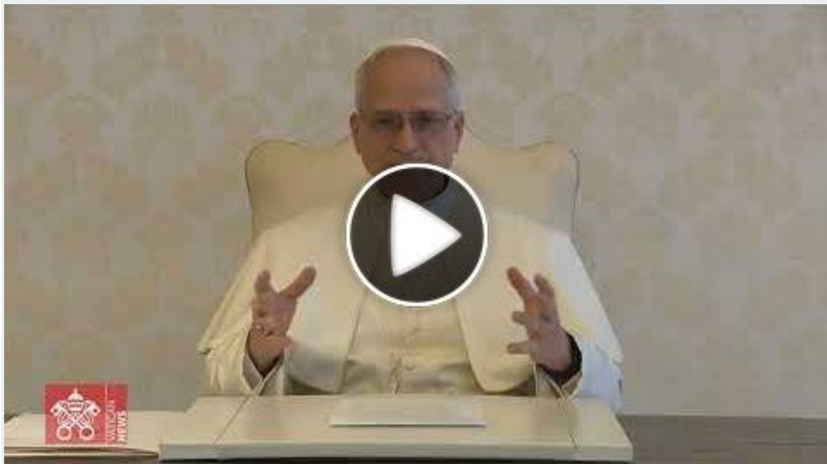
Video Message of the Holy Father to the young people of Chicago and the whole world.

serving doughnuts or the industry of hospitality. But for the Christian disciple, hospitality is founded in the very first days of creation. As we read the first chapter of Genesis, we see darkness welcoming the light, the sea welcoming the land, the land welcoming the plants, the plants welcoming the animals, and the animals stepping aside enough for the human beings to find a place. Hospitality is the welcoming spirit that is hard-wired into all of us because of creation. Disciples of Jesus learn, as adults, to transcend the mindset of stranger-danger and to embrace openness, especially for the least of our brothers and sisters. How are our parishes at welcoming others? Do we all see ourselves as ministers of hospitality, not only at Mass, but all week long?