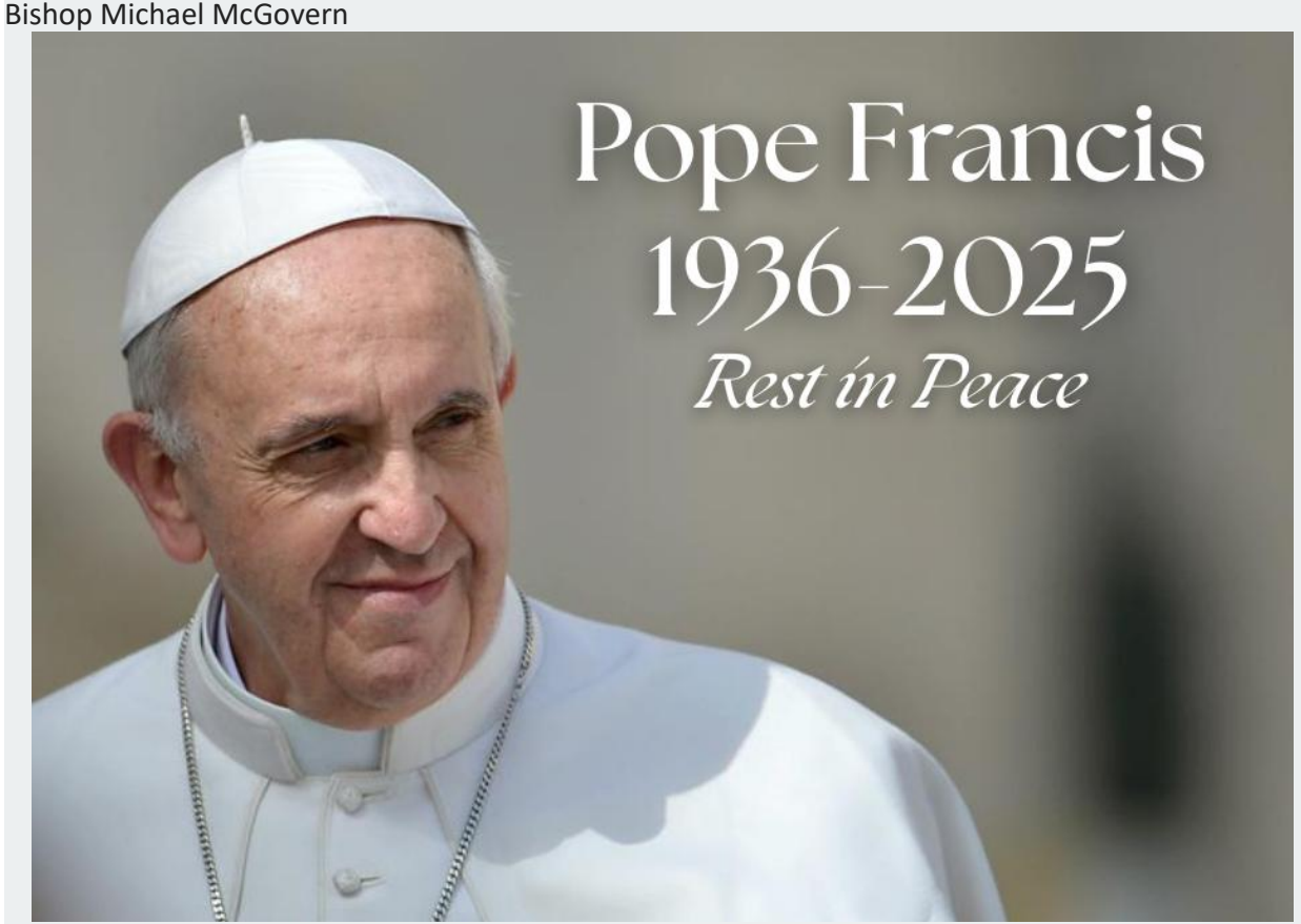
What happens after Pope Francis' death?