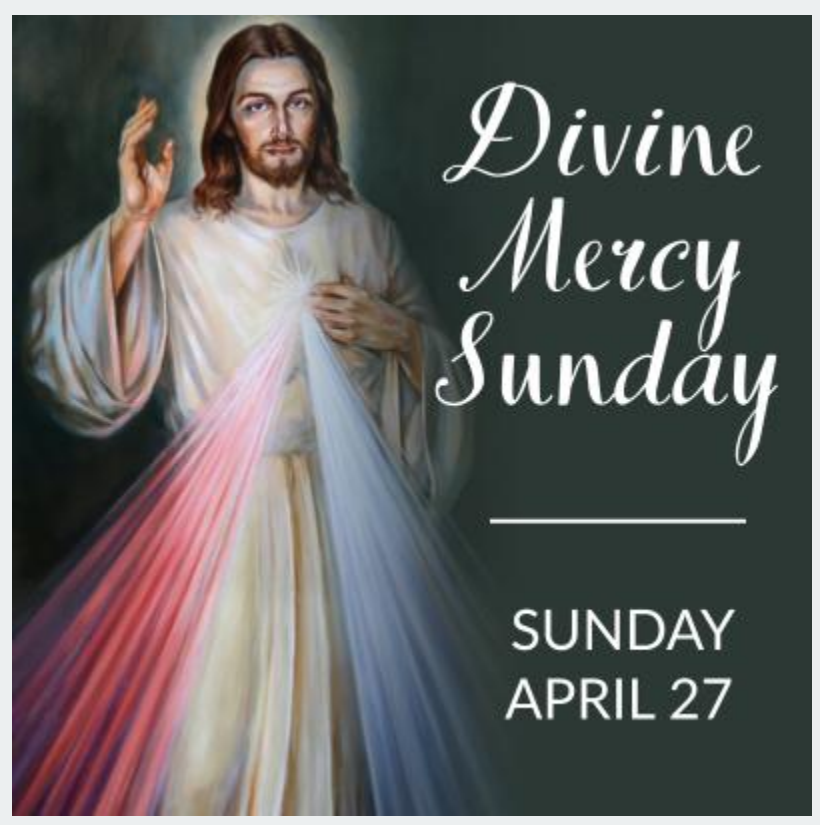
Click HERE for a list of parish events for Divine Mercy Sunday!

A black drape hangs above the doors at the Cathedral of St. Peter in Belleville as a sign of mourning.